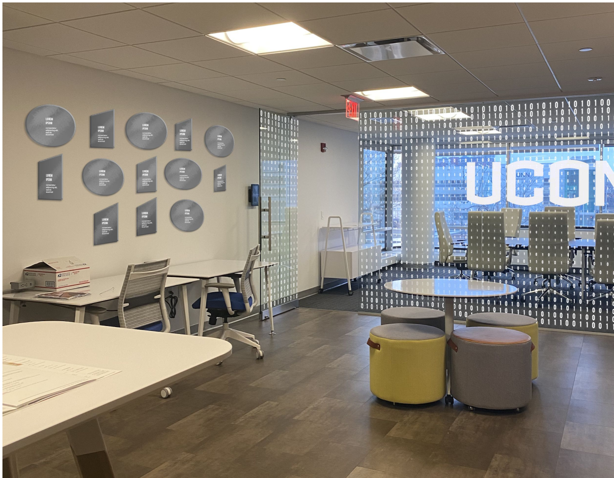
HOT DESK AREA: Donor/Partner Wall- Acrylic icon shapes with etched or printed white text/logos