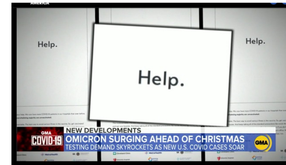
As seen on Good Morning America