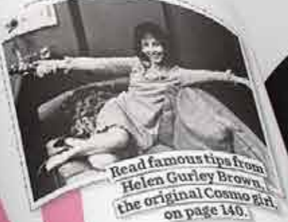
Read famous tips from Helen Gurley Brown, the original Cosmo girl, on page 140.

our necks. Her clothes were probably all the creation of some famous designer, and mine were 100 percent polyester (I didn't dare go near an open flame in them), but nonetheless, it seemed amazing to me that we were twins of a sort. And how prophetic that turned out to be. Within years later I found myself sitting in that same office as editor-in-chief of Cosmo. I couldn't help but flash back to that wonderful moment.