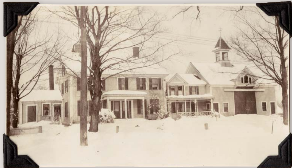
Transforming a historic but compromised Carlisle, MA home back to its original grace, and creating a collaborative workspace for our team, was a true labor of love with the most joyful results.