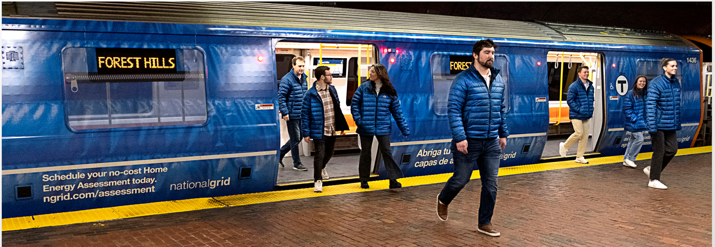
OOH—Train Wrap Signage