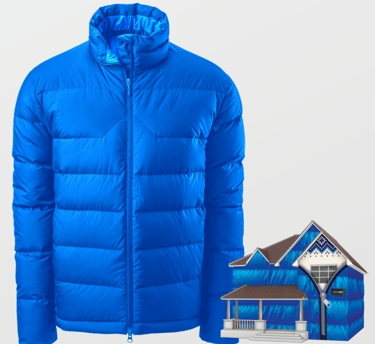
Air sealing is like a warm jacket.