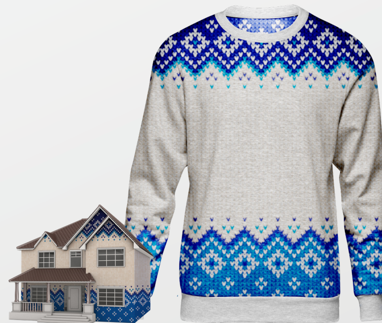
Insulation is like a sweater.

We needed a fresh, new way to educate customers and talk to them about the benefits of insulation and air sealing. To do that, we needed to let customers know that insulation and air sealing can greatly enhance the comfort, health and savings in their homes.