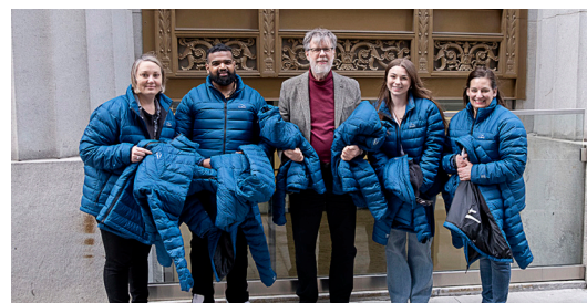
COAT DONATION EVENT