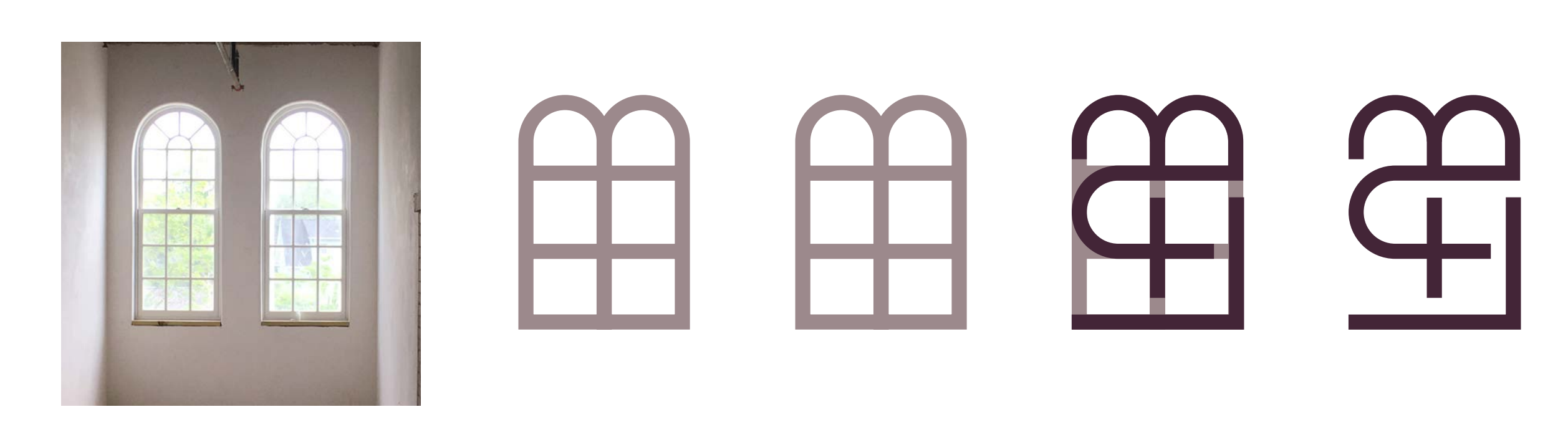
The Iconic Arches Evolution of The Lab's Identity

Building the logomark from abstracted arched windows and windowpanes.