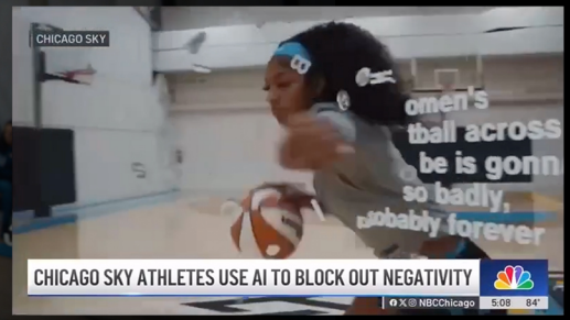
NEWS & PUBLICITY