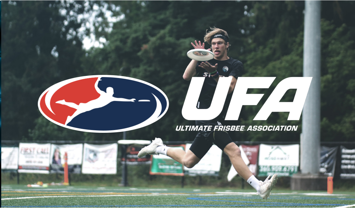
UFA IS A GROWING LEAGUE WITHIN THE AMERICAN SPORTS LANDSCAPE