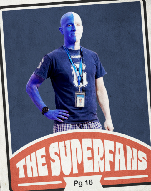
THE SUPERFANS Pg 16