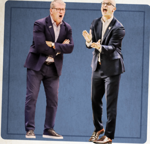
THE ARCHITECT & THE CARPENTER