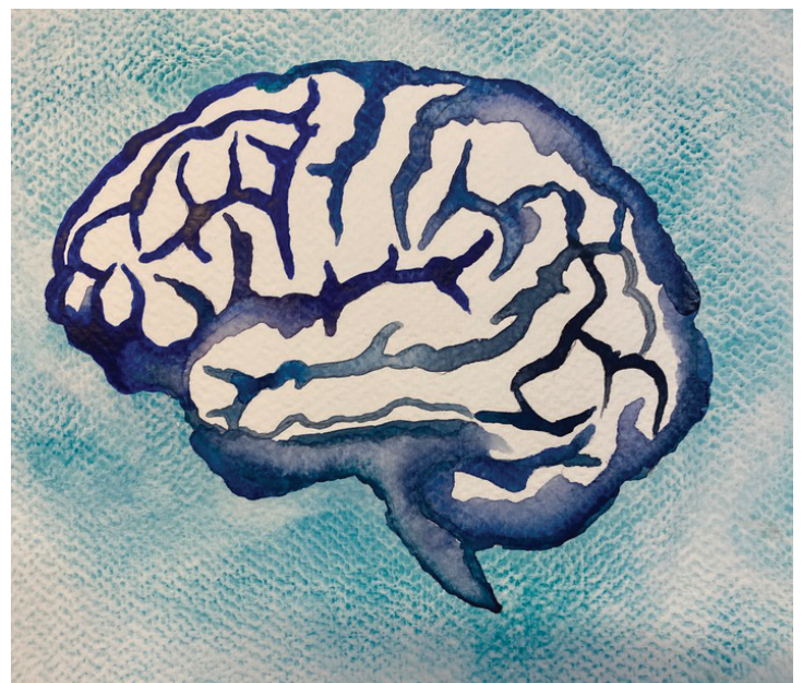
ORIGINAL WATERCOLOR ILLUSTRATIONS